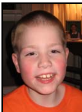
The face of autism

Autism by definition is a term that refers to a collection of neurologically-based developmental disorders in which individuals have impairments in social interaction and communication skills, along with a tendency to have repetitive behaviors or interests. The severity of autism varies greatly, from individuals with little or no speech and poor daily living skills, to others who speak and function well in most settings.