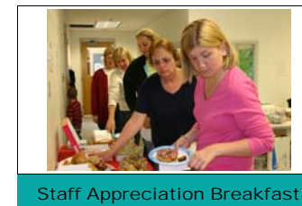
Staff Appreciation Breakfast